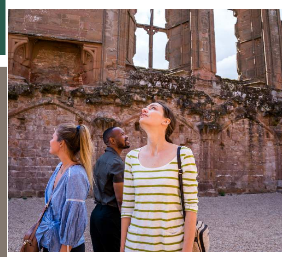
LONDON - OXFORD