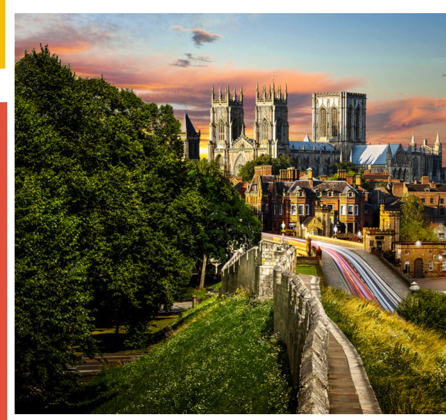
DURHAM - YORK