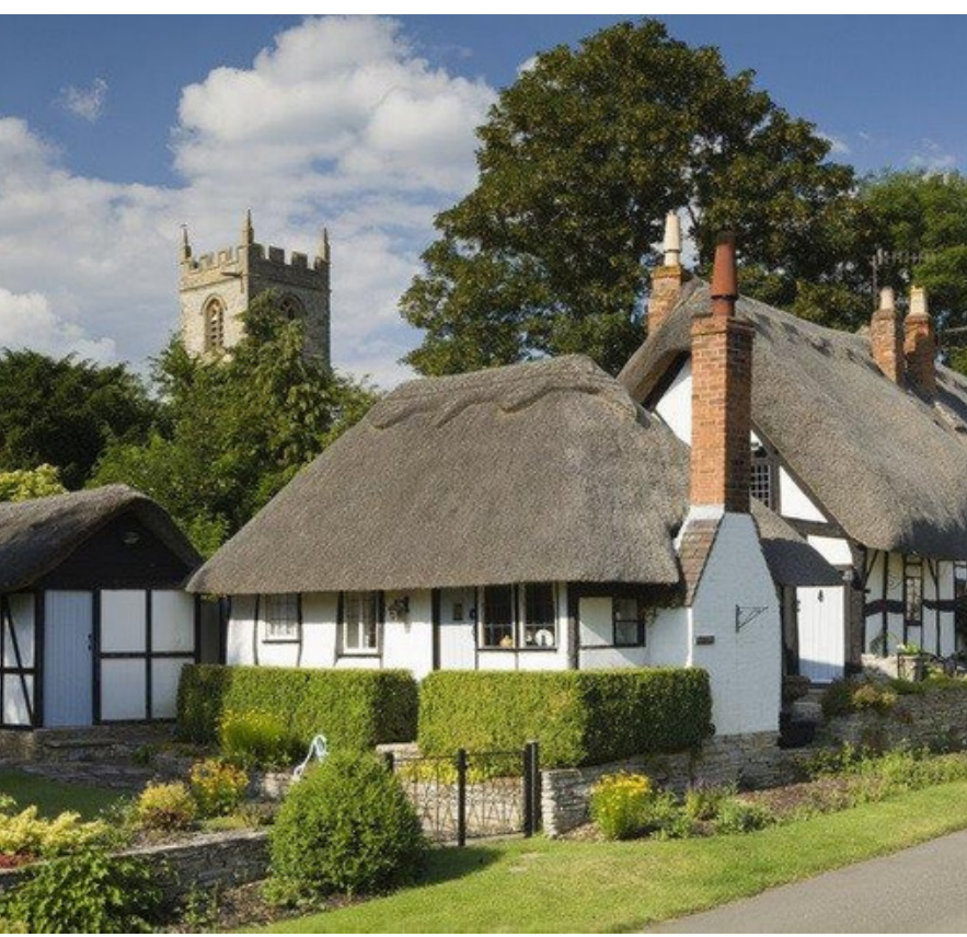
THE HEART OF THE COTSWOLDS

On this day, we suggest a shared tour in a comfortable mini coach discovering the beautiful villages of The Cotswolds . Step back in time and enjoy the beautiful and picturesque English countryside.