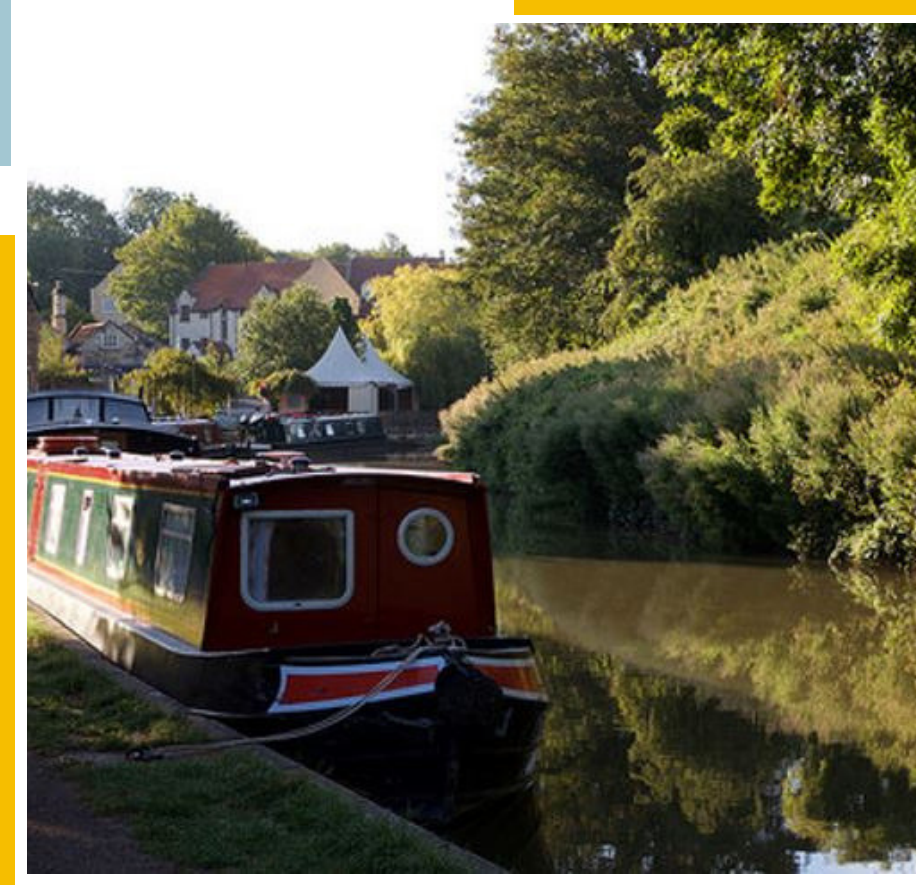
BATH - BRADFORD ON AVON